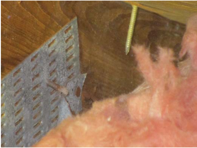
Clips - with minimum three nails