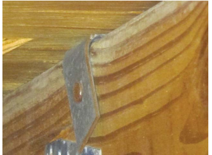
Single wraps - with minimum one nail on opposite side