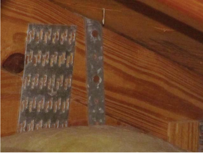
Single wraps - with minimum two nails on front side