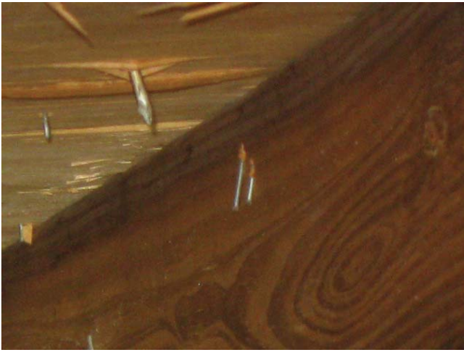
Staples - No evidence of re-nailing