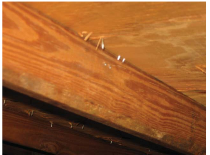
No evidence of re-nailing