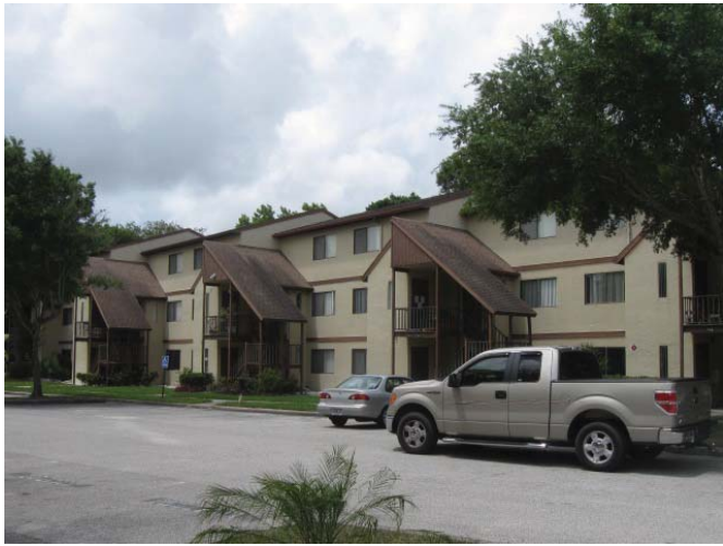
Front of the home