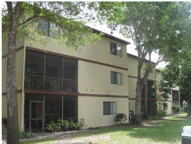
Rear of the home